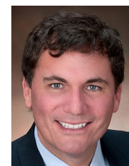
Minister Le Blanc, Fisheries, Oceans & the Canadian Coast Guard